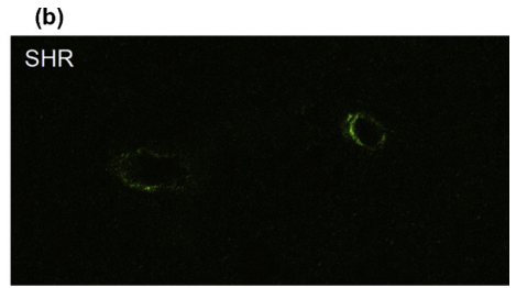
Fig. 1. Immunofluorescence labelling. The micrographs show immunofluorescence labelling against MCT1 (green) from WKY (a) and SHR (b). Strong staining is present on round structures probably representing brain capillaries. Some week fluorescence is visible in the rest of the neuropil. Scale bar = 10\,\mu\text{m} . The immunofluorescence labelling was significantly higher in SHR compared to WKY p = 0.01 (see Table 1 for statistics).